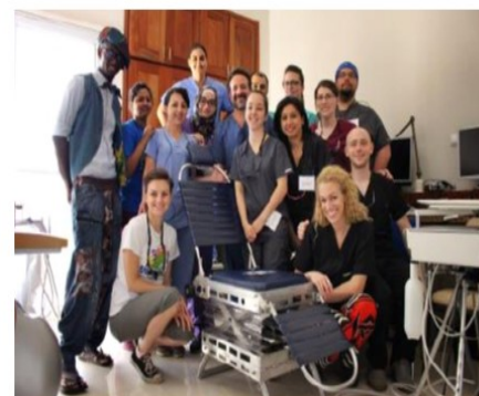
Senegal Trip (Summer, 2016)