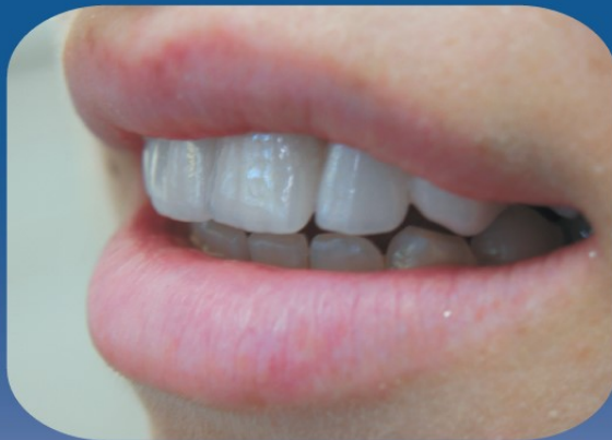
e. Max restorations 6-11

Serving Western New York Dentists Since 1993