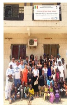
Senegal Trip (July, 2017)