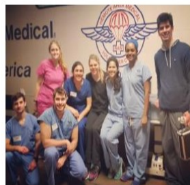
RAM (Remote Area Medical) Trips