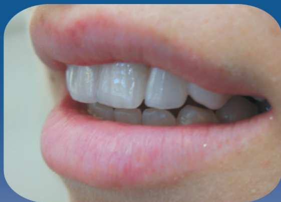
e.Max restorations 6-11

Serving Western New York Dentists Since 1993