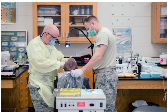
2017 North Carolina